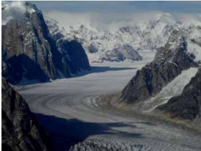
Flight to Mt. McKinley